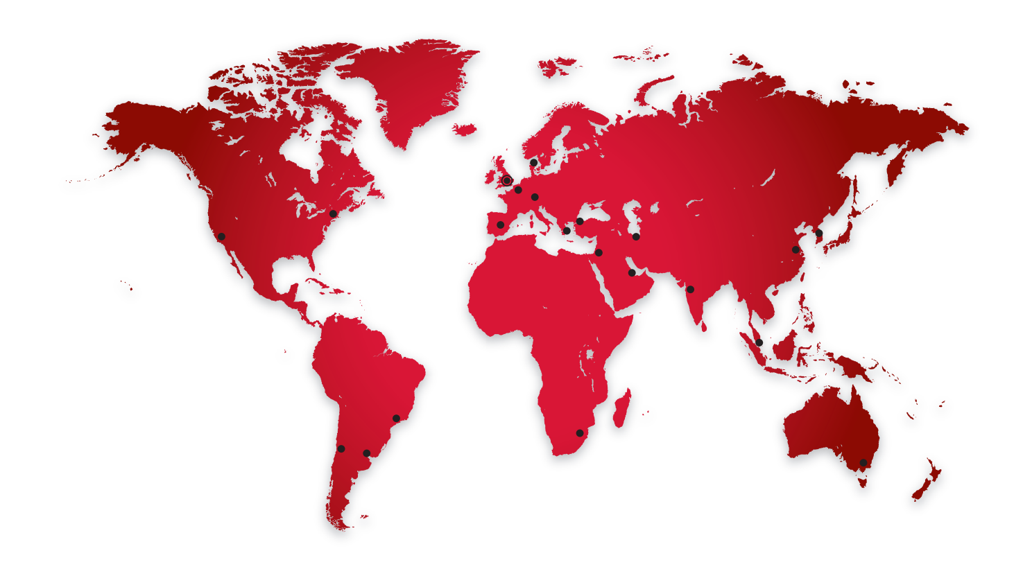
Africa • Americas • Asia • Europe • Middle East • Oceania